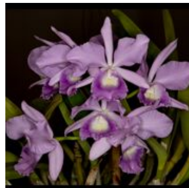
Lc. Blue Dynasty Merle Robboy