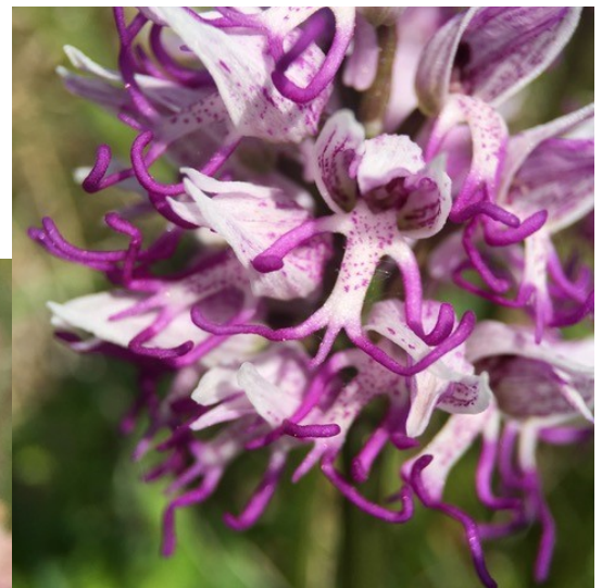
Orchis sima (above)