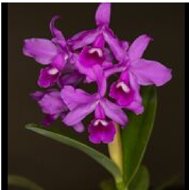
C. bowringiana 'San Diego'