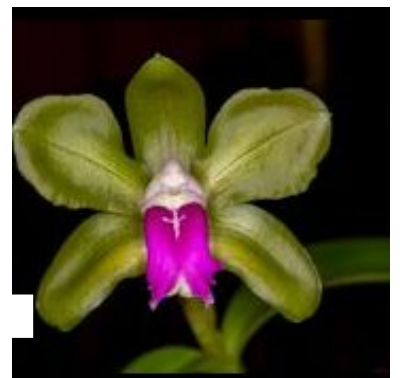
C. bicolor 'Gene's Choice' x C. bicolor Mendenhall-B... Carl Wood (right)